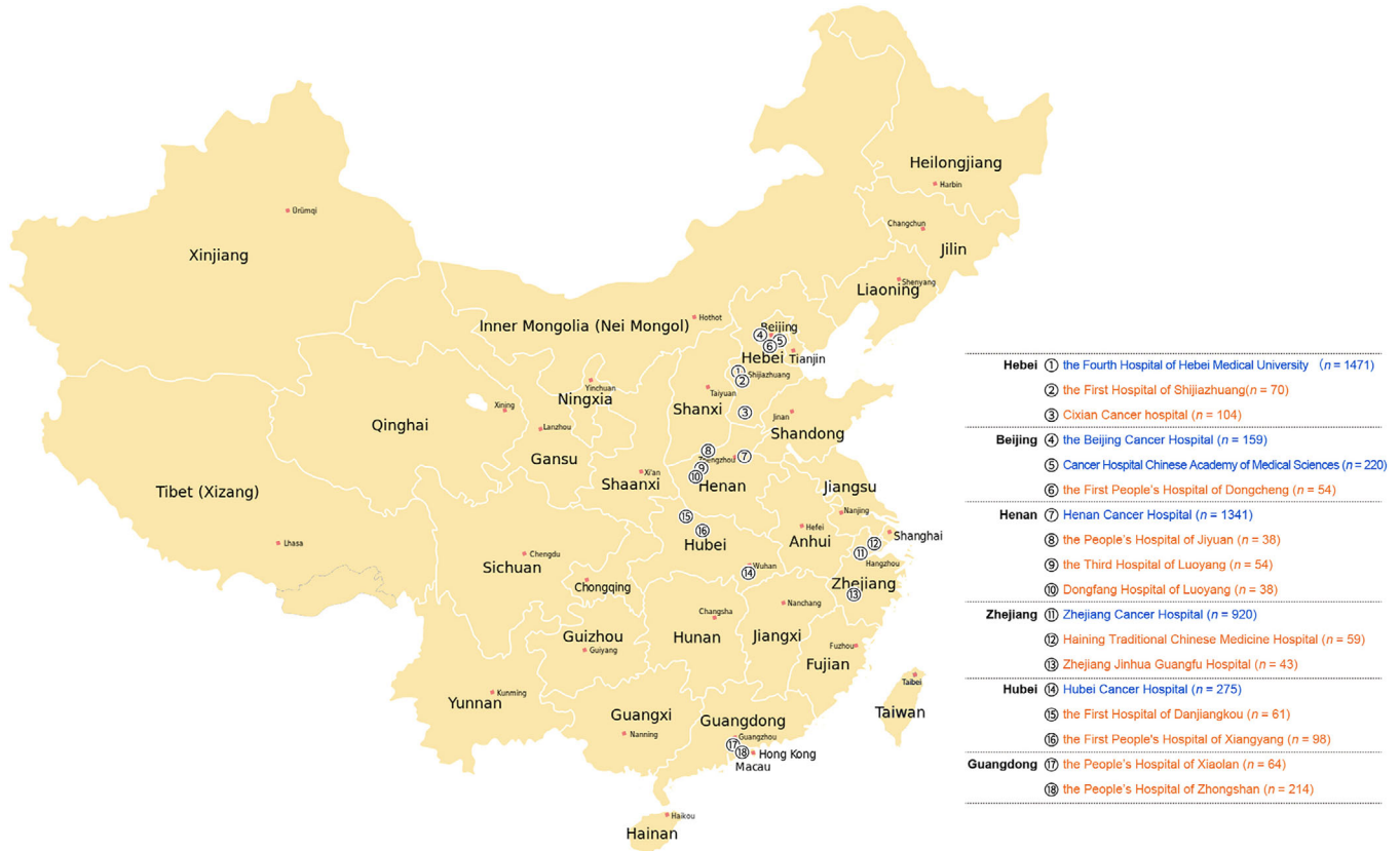
FIGURE 1 Distribution of the participating hospitals comprising of provincial (blue color), and municipal and county (orange color) hospitals

Therefore, the aim of this study was to use a large number of multicenter cases to determine the lifestyle and clinical risk factors related to the survival of EC patients in China. We believe that our findings could act as a guidance to help concerned authorities to improve the management of EC patients.